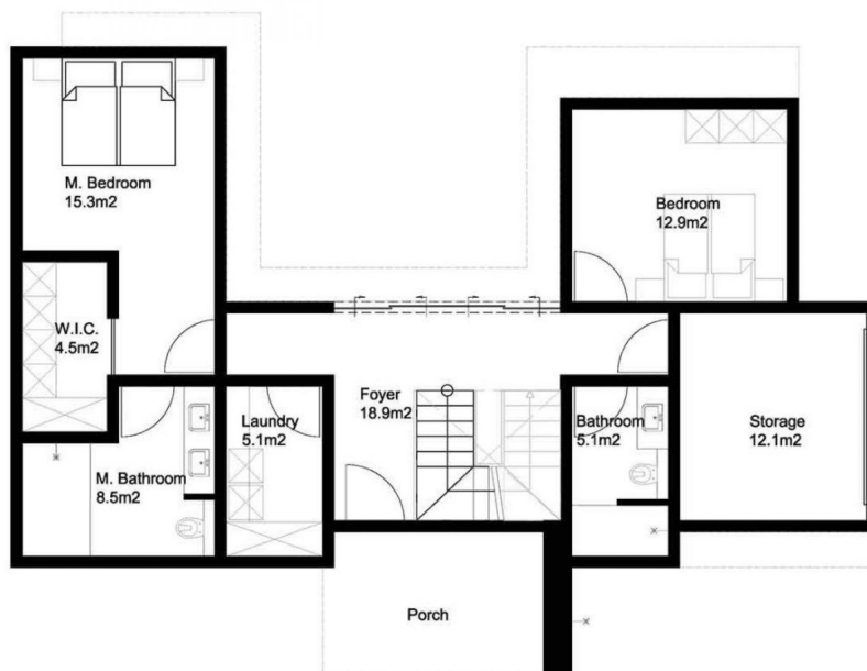
Ground floor 99.6m 2